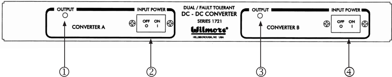
FIGURE 1. FRONT PANEL (shown without mounting brackets)